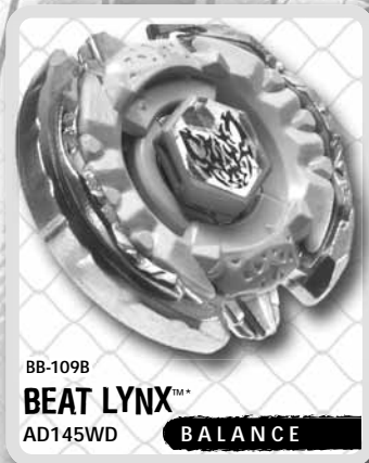
BB-109B BEAT LYNX™ AD145WD BALANCE